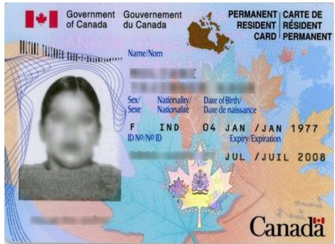
Canadian Permanent Residency Card